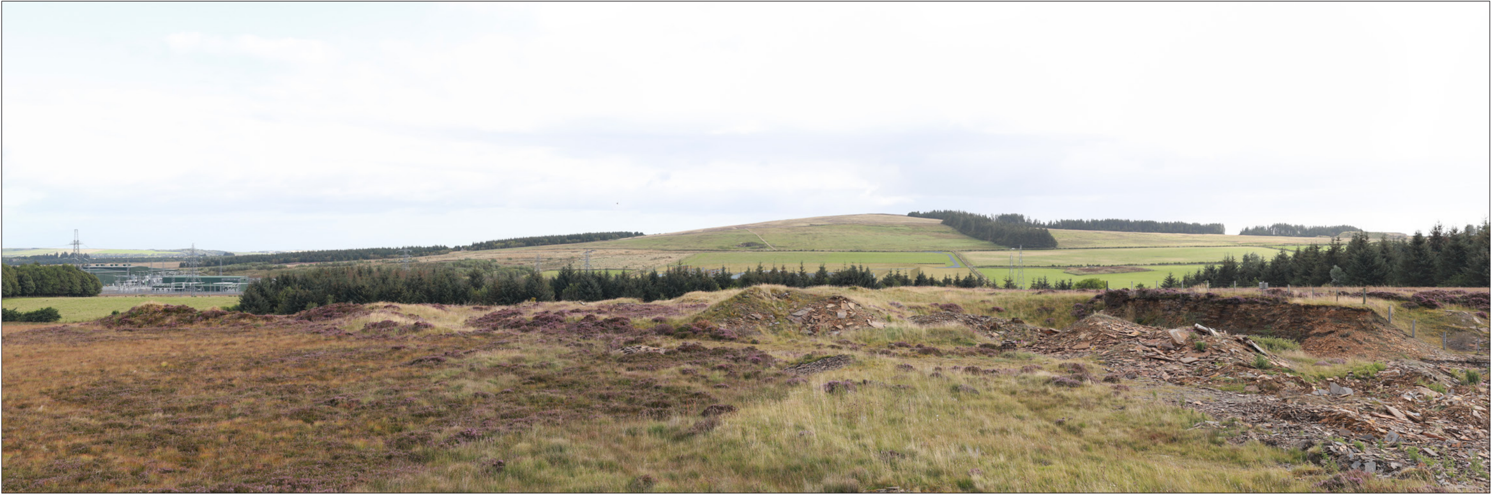
Photomontage Year 10 Viewpoint 5: Achanarras Hill Quarry Easting: 314945 Northing: 954536 View Direction: 53.2° Horizontal Field of View: 65.5° Camera Height: 1.5m Date: 22/08/2024 Time: 10:14

The images contained on this page and the following page are not representative of scale and distance from the actual viewpoint and show the development in its wider landscape context only.