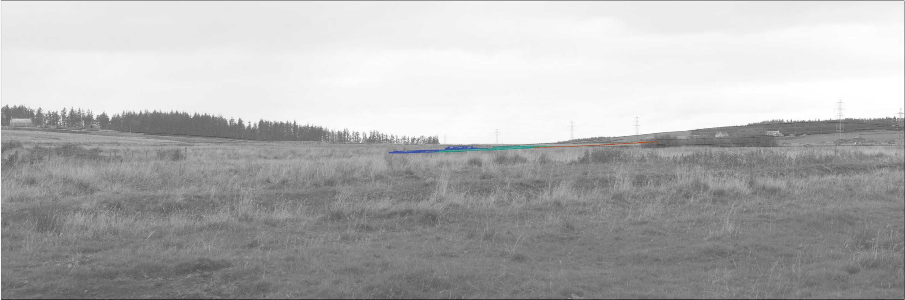
Photowire Viewpoint 4: Achanarras Hill Quarry Car Park Easting: 315681 Northing: 953554 View Direction: 0° Horizontal Field of View: 65.5° Camera Height: 1.5m Date: 22/08/2024 Time: 10:42

The images contained on this page and the following page are not representative of scale and distance from the actual viewpoint and show the development in its wider landscape context only.