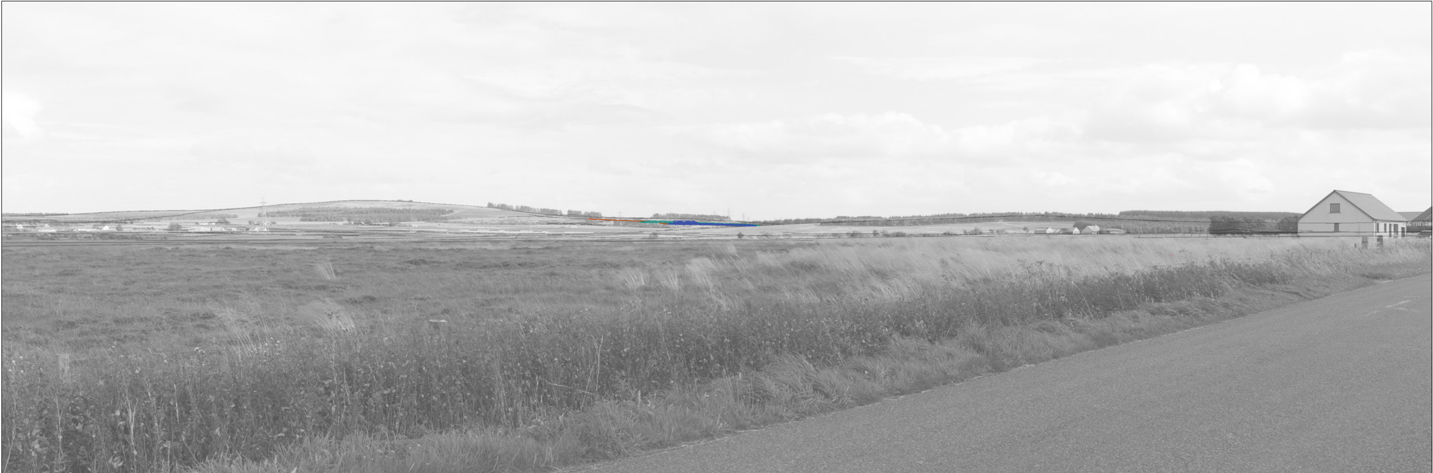
Photowire Viewpoint 6: Bridge Street, Yellow Moss Easting: 313376 Northing: 957343 View Direction: 134.8° Horizontal Field of View: 65.5° Camera Height: 1.5m Date: 22/08/2024 Time: 16:29

The images contained on this page and the following page are not representative of scale and distance from the actual viewpoint and show the development in its wider landscape context only.