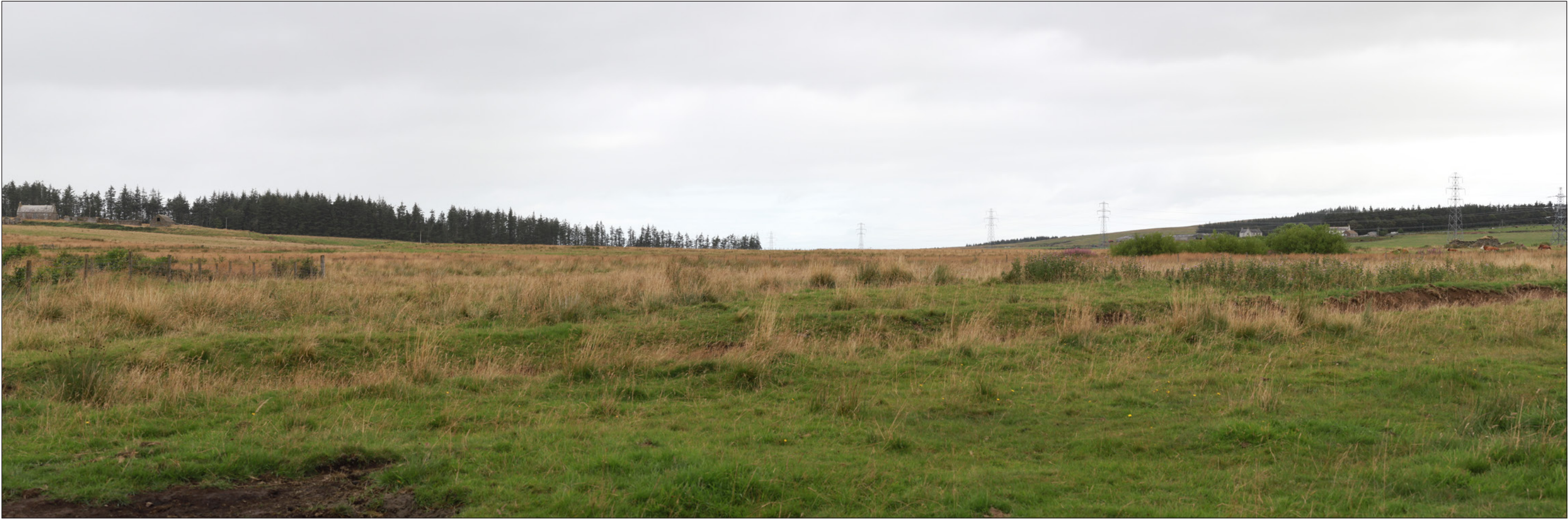
Existing View Viewpoint 4: Achanarras Hill Quarry Car Park Easting: 315681 Northing: 953554 View Direction: 0° Horizontal Field of View: 65.5° Camera Height: 1.5m Date: 22/08/2024 Time: 10:42

The images contained on this page and the following page are not representative of scale and distance from the actual viewpoint and show the development in its wider landscape context only.