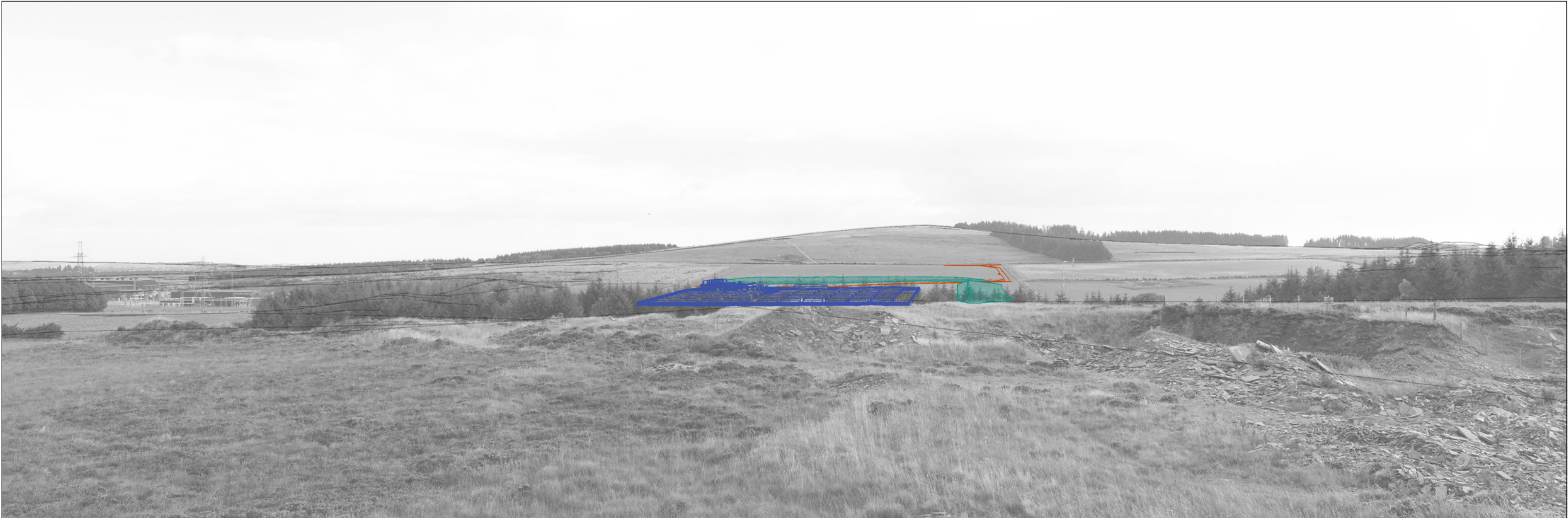
Photowire Viewpoint 5: Achanarras Hill Quarry Easting: 314945 Northing: 954536 View Direction: 53.2° Horizontal Field of View: 65.5° Camera Height: 1.5m Date: 22/08/2024 Time: 10:14

The images contained on this page and the following page are not representative of scale and distance from the actual viewpoint and show the development in its wider landscape context only.